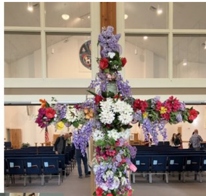
A Lovely Easter at Trinity!